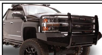
FULL FRONT REPLACEMENT BUMPER