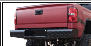
REAR REPLACEMENT BUMPER