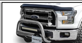
3.5 INCH OVAL BULL BAR