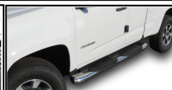
6" OVAL BENT STEP BAR

Keystone Automotive Operations Inc. (KAO) warrants this product to be free of defects in material and workmanship at the time of purchase by the original retail consumer. KAO disclaims any other warranties, express or implied, including the warranty of fitness for a particular purpose or an intended use. If the product is found to be defective, KAO may replace or repair the product at our option, when the product is returned prepaid, with proof of purchase. Alteration to, improper installation, or misuse of this product voids the warranty. KAO's liability is limited to repair or replacement of products found to be defective, and specifically excludes liability for any incidental or consequential loss or damage.